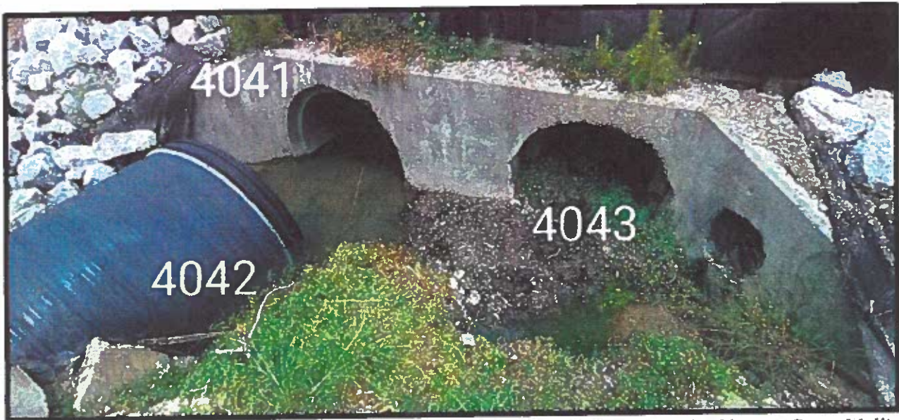
Figure F2: Downstream end of the closed drainage system running parallel to the Blanton Court Mullins Housing Authority Area