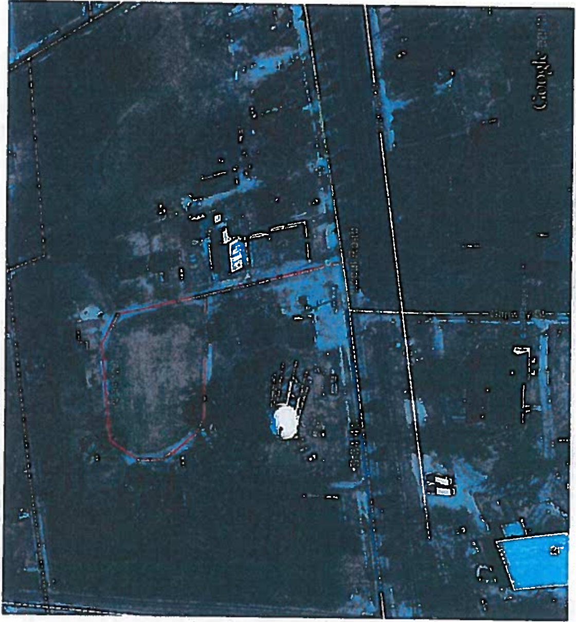
S-128 no longer connects to the state system and we want to know if the district will approach the city or county about taking this on. This occurred when a portion of S-41 was removed in 2005 that caused the disconnect. T